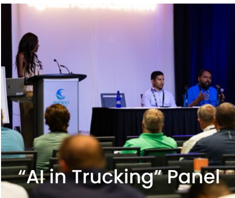
"AI in Trucking" Panel