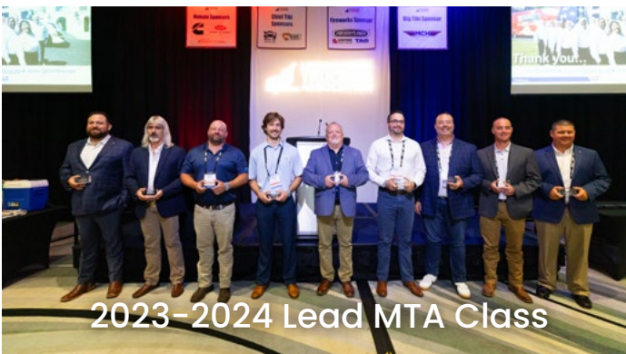
2023-2024 Lead MTA Class