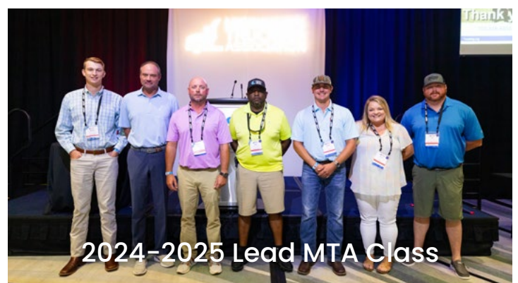
2024-2025 Lead MTA Class