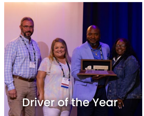
Driver of the Year